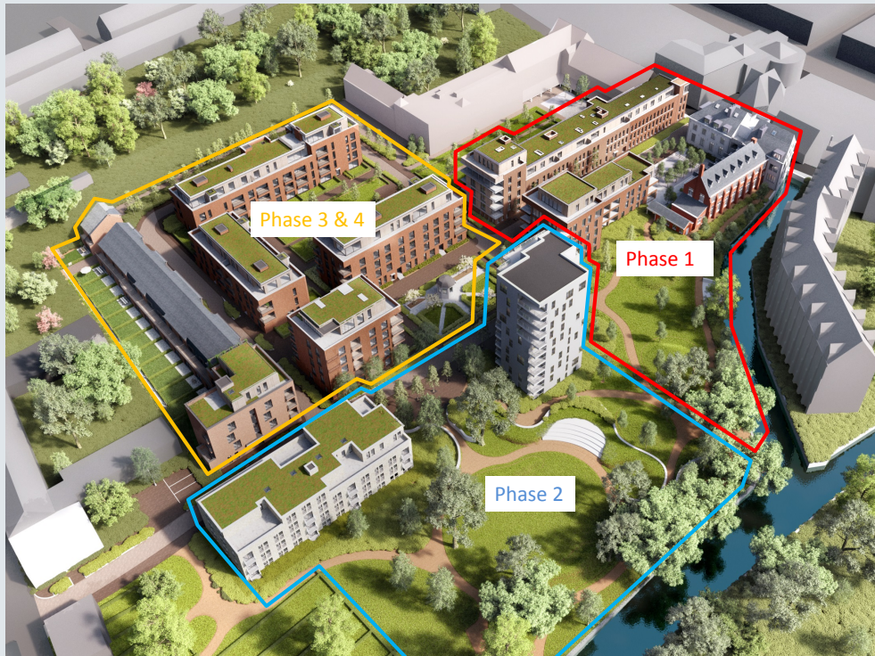
Figure 2. Janseniushof development.

< 25 kWh/m 2 per annum) and a local district heating network at higher temperatures (90/70 °C) for the existing buildings (heat requirement < 70 kWh/m 2 per annum).