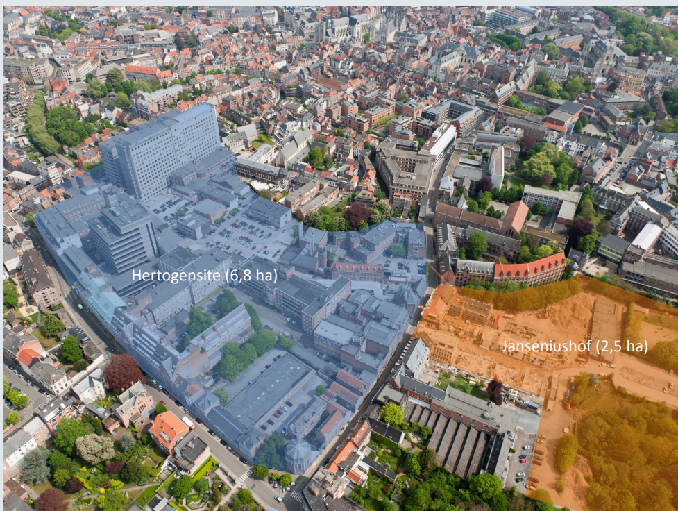
Figure 1. Hertogensite and Janseniushof project development at Leuven.

This project is related to a large masterplan for urban renewal in the centre of Leuven. The district is called Hertogensite and is based on the renovation of the former St.-Rafaël - St.-Pieter hospital campus in the heart of Leuven. See Figure 1. Real estate developer Resiterra is building a new, sustainable, multifunctional urban development, a combination of new construction and deep renovation, on the 68 000 m 2 terrain. Since sustainability was paramount, it was decided to make use of a combination of renewable energy sources and two thermal energy networks: a local low-temperature energy grid with cold and heat storage (geothermal) in aquifers for the new buildings (heat requirement