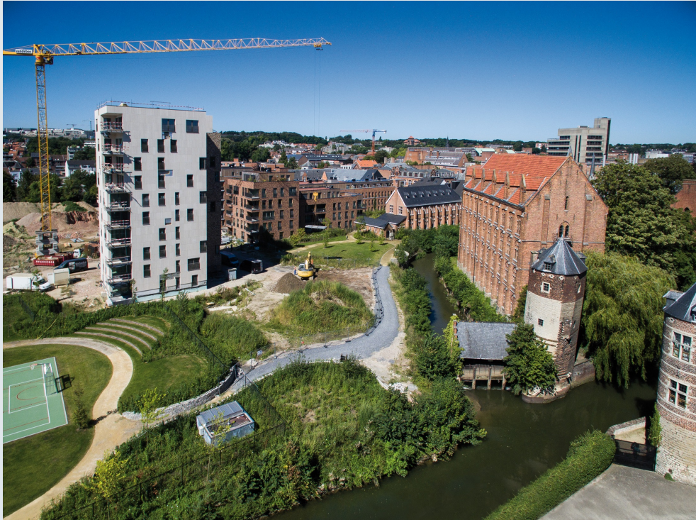
Figure 3. Janseniushof construction site and river Dijle