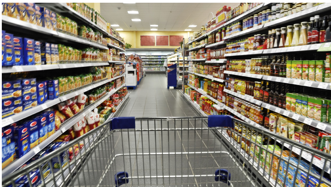
Figure 1. The refrigeration system of a supermarket is often used as a heat pump, to provide hot water and space heating for the sales area.