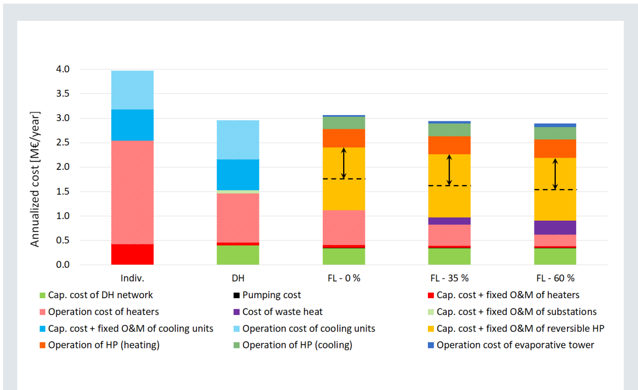
Fig. 2: Annualized costs for the different scenarios. Investment, operation and maintenance, as well as energy costs are fully included. Personnel and additional company revenues for the district scenarios are instead not considered. Investment costs for HPs are taken from reference values for single installations. Black arrows indicate the expected potential decrease of HP investment costs on the basis of alternative market investigations and economies of scale.

Summarizing, five different scenarios related to a Southern European climate and a city zone with 500 small multifamily houses were analysed. The FLEXYNETS approach was compared to traditional individual and district systems, under the assumption of no “convenient” high-temperature sources in the surroundings. Different shares of low-temperature waste heat were instead considered.