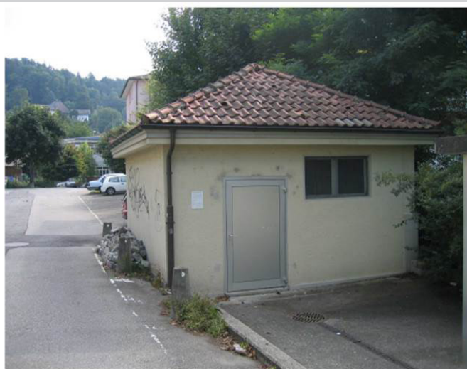
Fig 1: Pictures of the pumping station inside (left) and outside (right) at Bachstrasse.