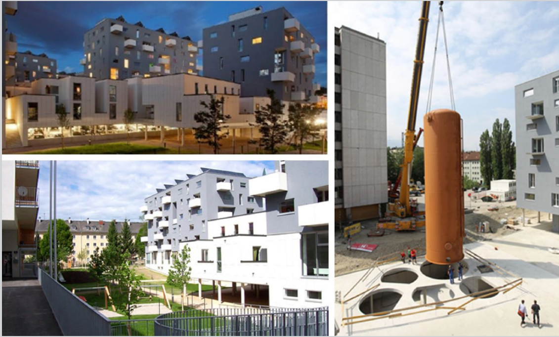
Fig 1: Residential complex Lehen [Salzburg AG]