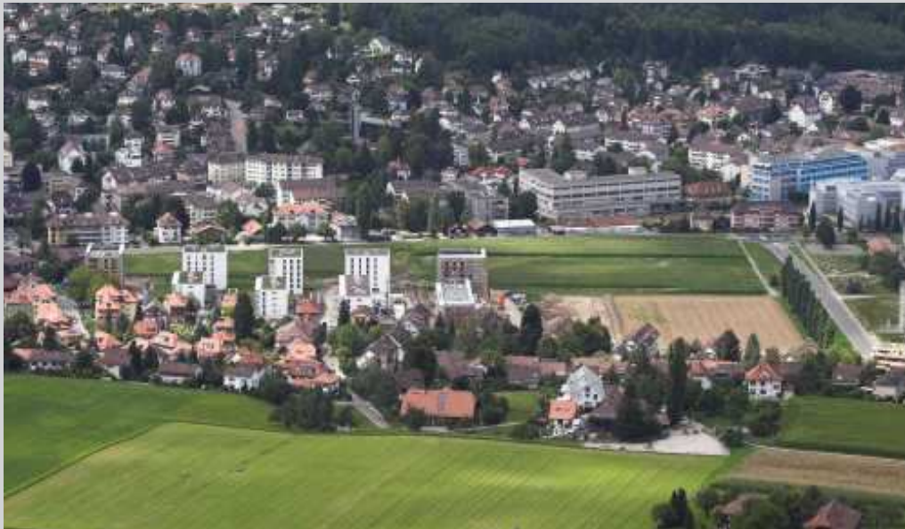
Fig 1: Areal view on the Dreispitzareal, Köniz.