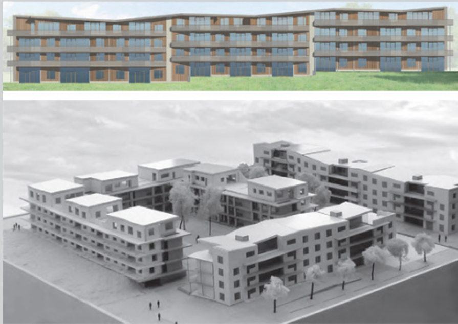
Fig 1: Model of the neighborhood Oberfeld in Ostermundigen.