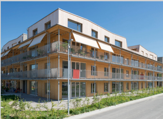
Fig 2: Pictures of the realized neighborhood in Oberfeld in Ostermundigen.

” ENERGY FOR HEATING AND COOLING FROM THE SUN AND EARTH“”