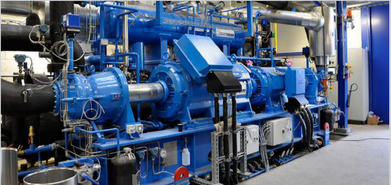
Fig. 1: Heat pump at the location of the „Marienhütte“ (Götzhaber et al., 2017)