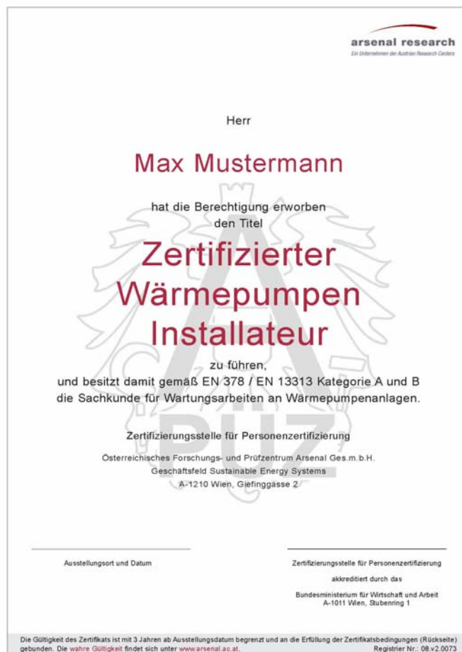
Figure 4: National Certificate