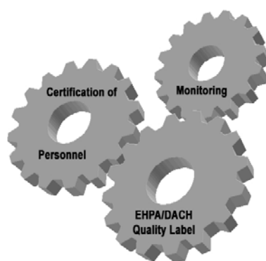
Figure 1: Quality improvement